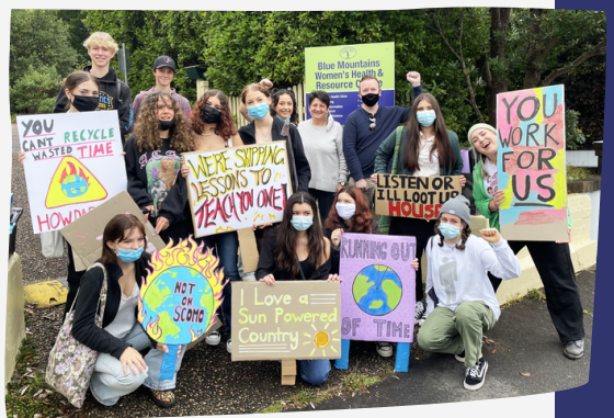
EVIE Members attending the School Strike for Climate Rally March 2022

– Quote taken from participant during 2021 EVIE Planning Session