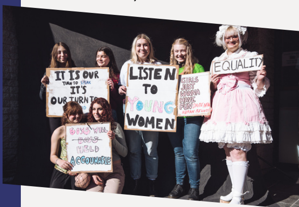
EViE Members attending the Blue Mountains 'Enough is Enough' Rally June 2021